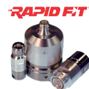
RAPIT FIT™ Connectors

Radio Frequency Systems line of high performance coaxial cable connectors are designed specifically to provide the highest quality connector-cable interface while simplifying and speeding up the attachment of connectors to CELLFLEX® coaxial cables. RFS connectors are fully tested for mechanical and electrical compliance specifications. They are available in all popular cable sizes in a variety of mating interfaces. The N connector is one of the most common RF connector types. N type connectors from RFS will be delivered with a non-slotted outer conductor contact sleeve and a special gasket. Due to a special design of the coupling nut (without spring ring) N connectors can be tightened with increased torque. This increases the contact pressure.